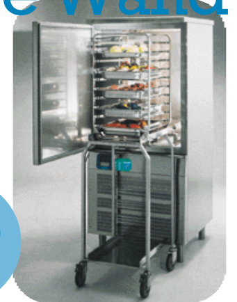
4 Blast Chiller

Ross County Health District | Environmental Health Division