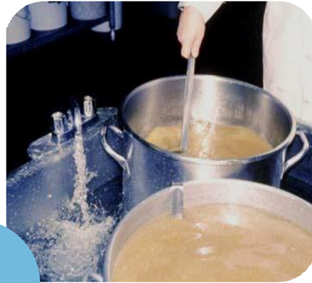
1 Ice Bath