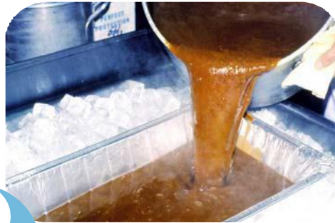
3 Shallow Pans (not deeper than 2 inches)