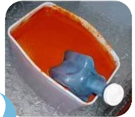
2 Ice Wand